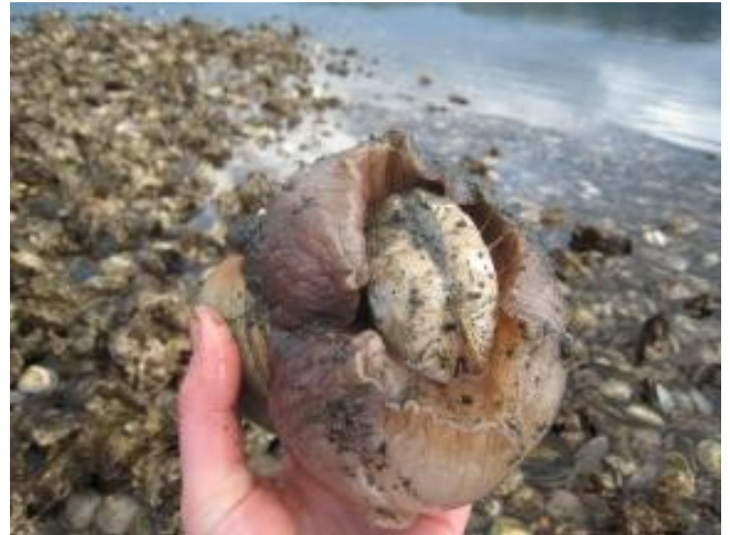
A moon snail feasts on a cockle

To be a catalyst for environmental education contributing significantly to our community’s understanding of the environment in which we live and our impact on the Puget Sound.