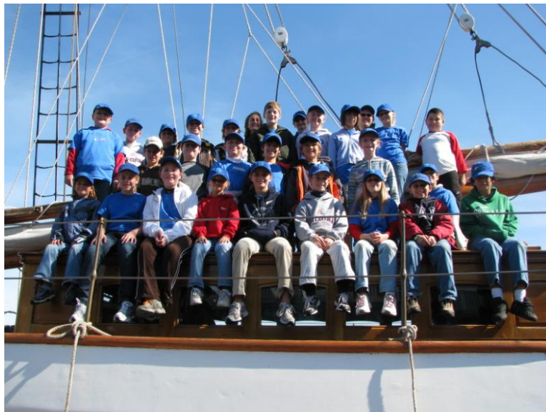
seaStars and sunStars aboard the Adventuress

In 2008, Harbor WildWatch reached 10,900 people through 246 environmental education programs and workshops.